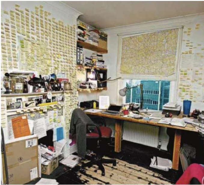
Will Self's Room 8

In addition to the relative chaos or tidiness of the writing desk and the room itself, the frequency of planning materials posted around authors’ rooms suggests different methods of composition and crafting. The physical materials that authors use to construct a work are more various, it seems, and perhaps less uniform than those of visual artists, for example. Will Self’s planning materials are hundreds and hundreds of post-it notes arranged methodically around his walls: