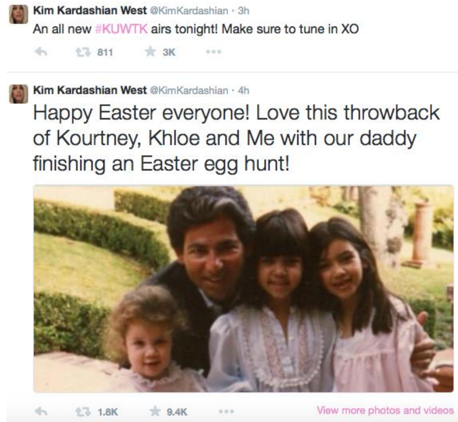
Fig. 1: A screenshot of Kim Kardashian West’s Twitter stream

Kardashian’s Twitter stream featuring two of her personal Twitter posts (5 April 2015).